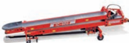
Single- or Twin-Conveyors