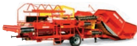
Combi Unit Picking/Separating Unit