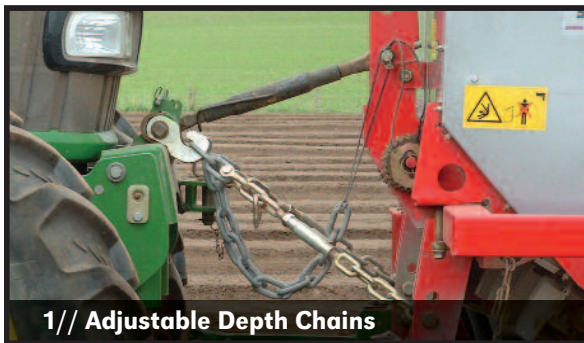
1// Adjustable Depth Chains

The Grimme Front Mounted Fertiliser Unit has been developed from the fertiliser placement units fitted to the Grimme Range of trailed planters. The unit mounts to the tractor front linkage and depth is controlled by the adjustable depth chains. The fertiliser is metered by stainless steel augers which are driven by the land wheel. Application rates are achieved by the selection of the varying drive/driven sprockets to give the required application rate. An agitator system in the bottom of the hopper ensures even feed to the augers. The standard hopper holds 450kg and is fitted with a flared top and top cover sheet.