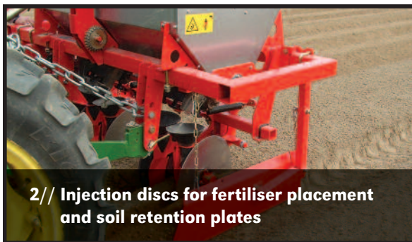
2// Injection discs for fertiliser placement and soil retention plates