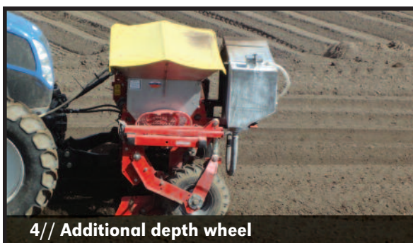
4// Additional depth wheel