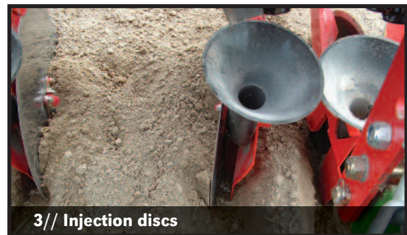
3// Injection discs