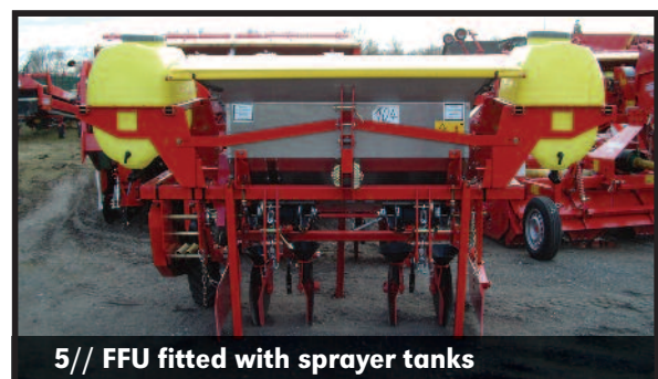
5// FFU fitted with sprayer tanks

Grimme UK Ltd Station Road, Swineshead, Boston, Lincolnshire PE20 3PS t: 01205 822 300 f: 01205 821 196 e: sales@grimme.co.uk